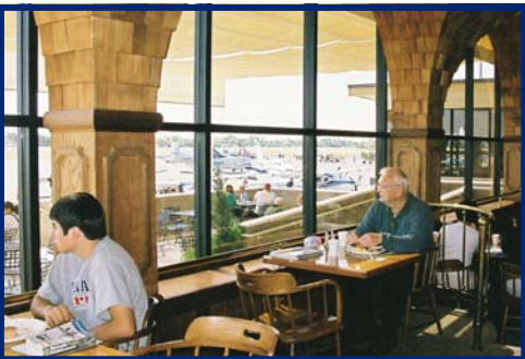
Aviators Restaurant patrons enjoy a meal and a view at Executive Airport.

Aviators Restaurant is open for breakfast and lunch daily and for dinner on Friday and Saturday. The restaurant can be booked for private events. Call (916) 424-1728 for more information.