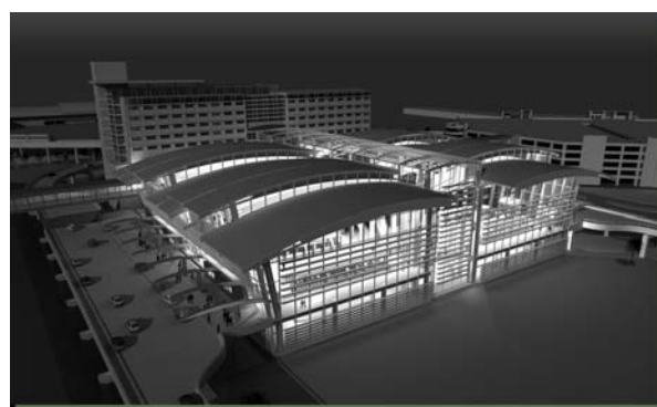
Terminal Design Concept #2